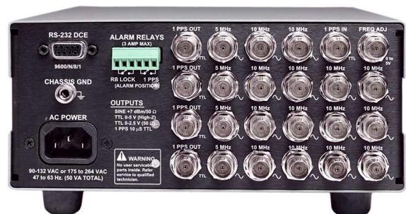
FS725 rear panel (with opt. 03)